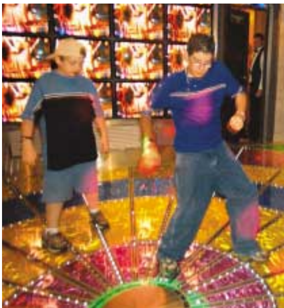
Photographs: Carnival Cruise Lines